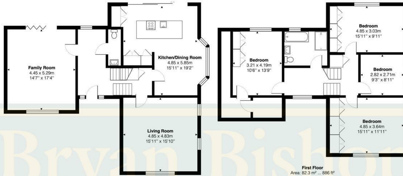
Ground Floor Area: 92.1 m 2 ... 991 ft 2